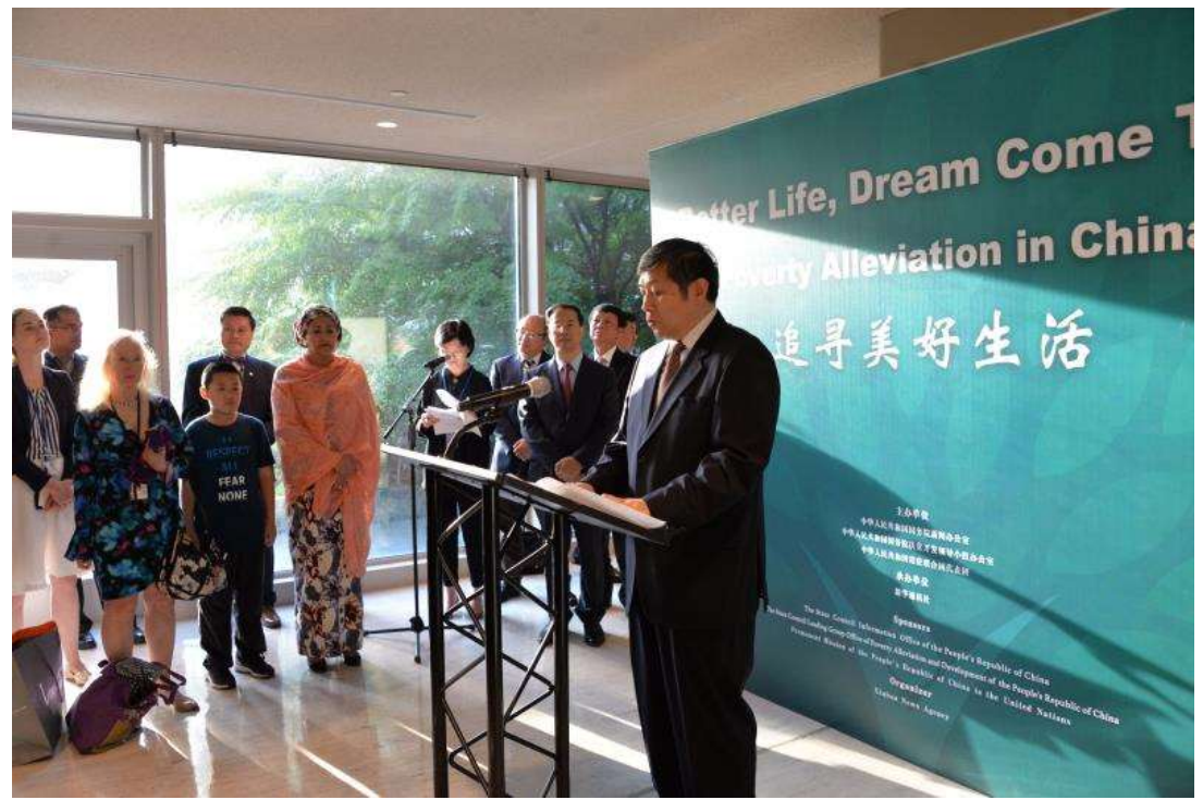
China's Permanent UN Representative Ma Zhaoxu delivered a speech during the opening ceremony on June 29, 2018.