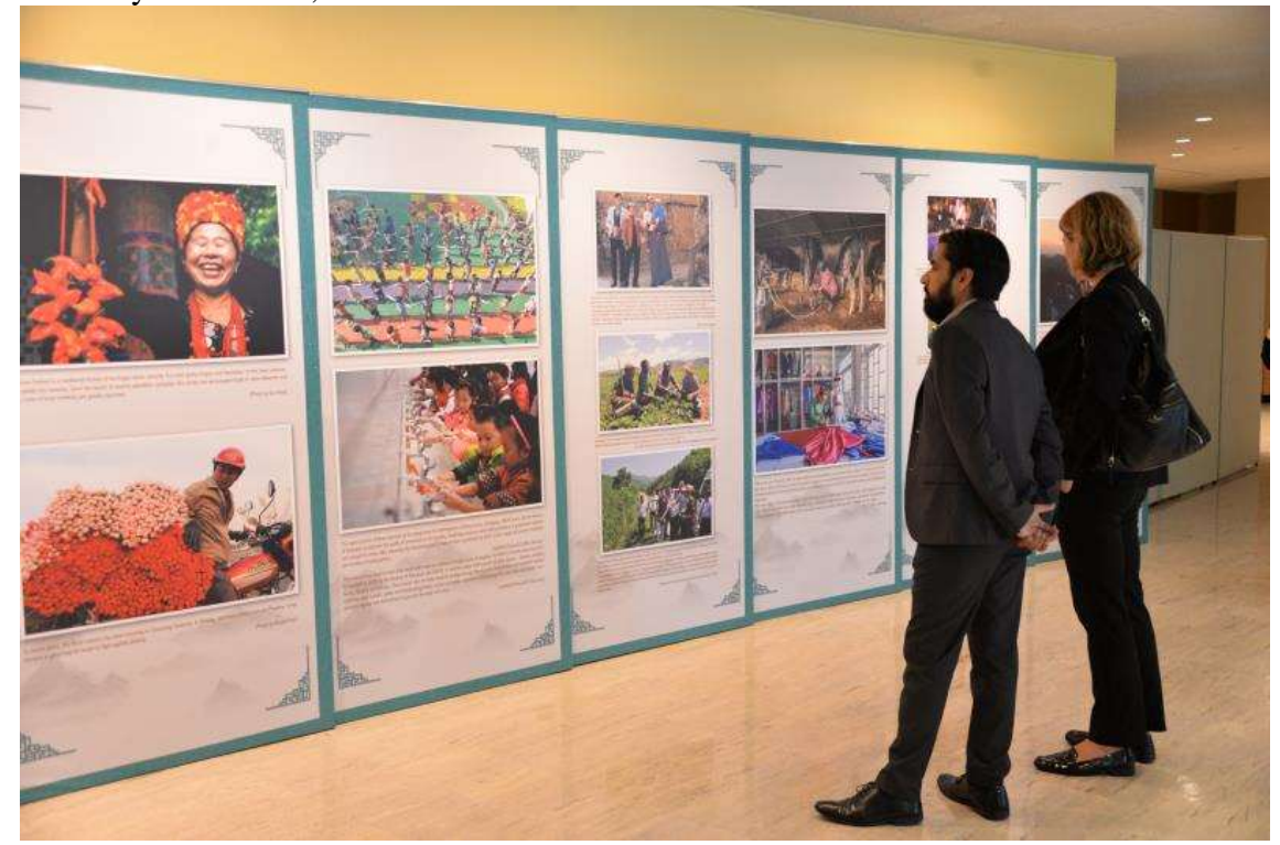
Visitors admire the "Better Life, Dream Come True Povert Allevaiation in China" opening on June 29, 2018.