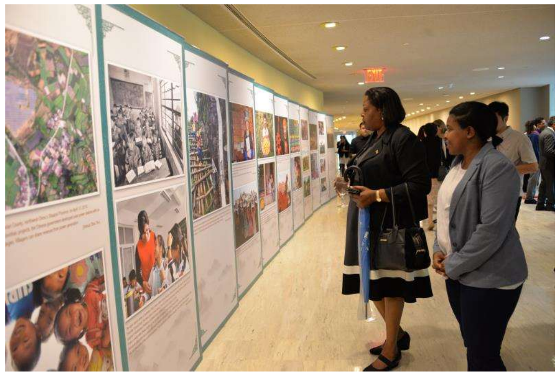
Visitors admire the "Better Life, Dream Come True Povert Allevaiation in China" opening on June 29, 2018.