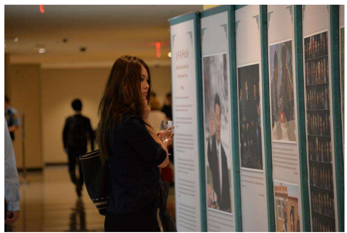
Visitors admire the "Better Life, Dream Come True Povert Allevaiation in China" opening on June 29, 2018.